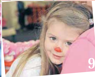
6 – WEDNESDAY, June 30, 2010 The Extra